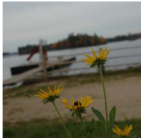
Brown Eyed Susans, Oconto's original emblem, still grow wild up at camp