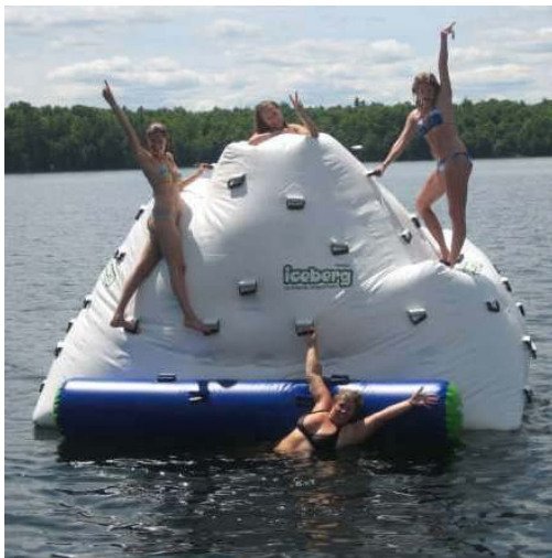
The Oconto Iceberg!