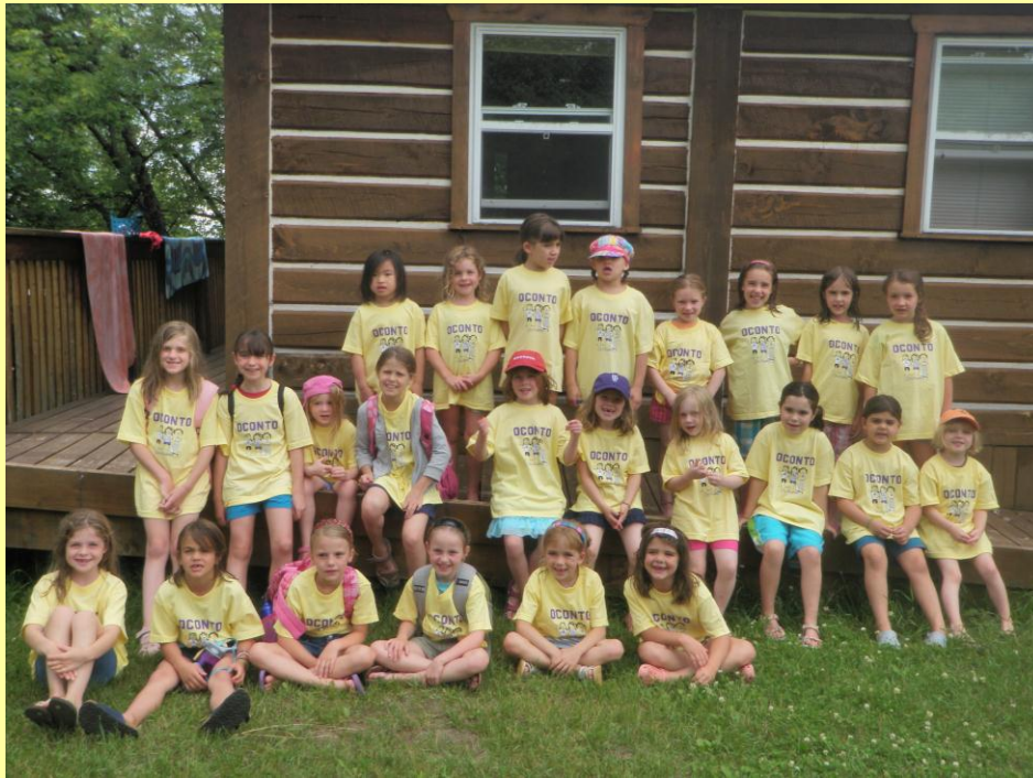
The June 2010 Chickadees in their brand new t-shirts!

This summer, we are very excited to be running our kinder camp program, Chickadees, for the second year in a row. For one weekend in June and one weekend in August, we open camp to girls ages 4 to 8 looking for adventure and a taste of life away from Mom and Dad! During their stay, they get the opportunity to try out many of our activities on both land and water, while meeting new friends and gaining the independence that comes with spending time away from home. We have several staff on hand to travel along with the group as they explore camp and get a taste of what it is to be an Oconto girl! If you know of a young girl that is eager to try out a stay at camp, please think of Oconto Chickadees! It is the perfect way to ease into the camp life!