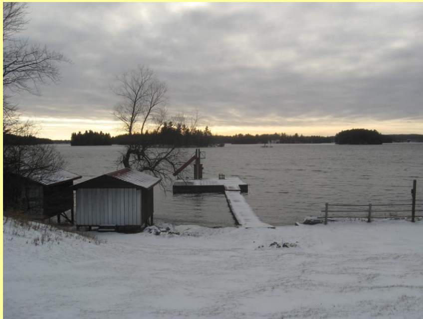
Main Dock in January

www.campoconto.com ! I am happy to come to people's homes to show them all about Oconto and answer any questions that they have. If you know anyone who wants to learn more, please call the camp office at 905.470.2030.